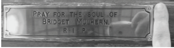
Sample name plate to be dedicated to the living or deceased.

Over the next couple of months, the Church Office will be contacting parishioners, who sponsored the purchase of a pew at the end of 2018, in order to determine what they would like engraved on the pew plaque. Also, if the $50 payment is still outstanding, this will be collected as well.